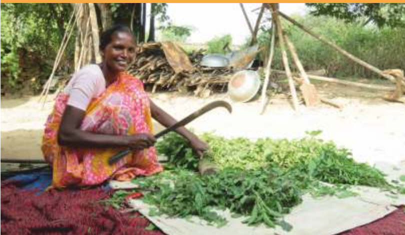
Medicinal Plants : Transforming Agriculture... Touching Lives...