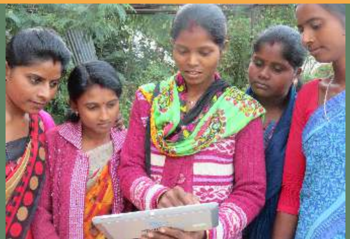
Leveraging Technology to empower communities