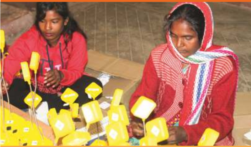
Solar Lamp Igniting Rural Jharkhand