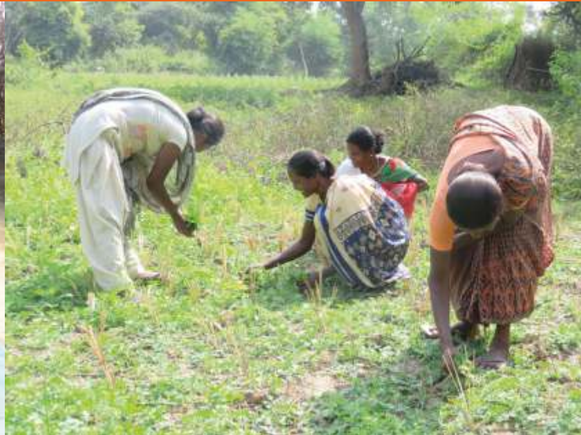
Sakhi Mandal members cultivate medicinal plants in barren lands.

Jharkhand is blessed with a rich reservoir of natural resources in the form of medicinal and aromatic plants. The state can boast of more than 1,500 species of these plants, which together contribute to 5% of the overall herbal medicinal production in the country. At the same time, Jharkhand is also recognized for its Non Timber Forest Produce (NTFP).