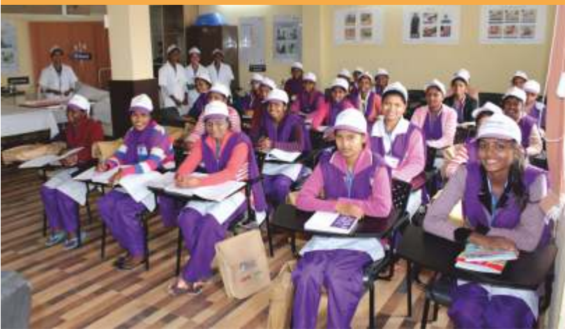
DDU-GKY : Skilling up Rural Women