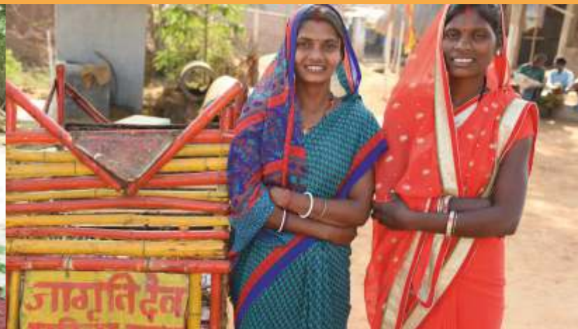
Sakhi Mandal Members taking the SBM-G campaign forward