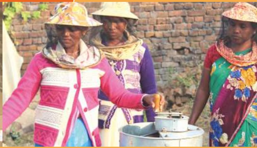
Sakhi Mandal Members taking Garu Honey collection as a livelihood intervention